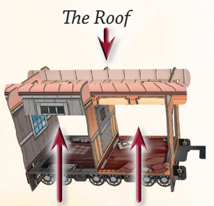
The Cell The Corridor

Extract from the Manual for the Perfect Pirates of the Far West, p. 247: "Sooner or later, a bandit will find himself in a cell. A true Pirate of the Far West would never think of that cell as an end, but rather as a transition point. One must commune with the cell; be one with its hopes and dreams; understand its struggles for meaning and purpose. BE the cell!...and find the flaw in its cheap construction."